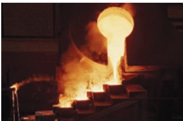
Although it has partly shifted from copper to agriculture and forestry, Chile still relies largely on natural resource exports.

Chile's current prowess in agribusiness could similarly propel Chile to a position of leadership in international agro-biotechnology development. One can envision Chilean firms employing scientists on the forefront of agricultural technological innovation. They would develop new crop strains, genetically engineer pestilence solutions, and engage in other activities