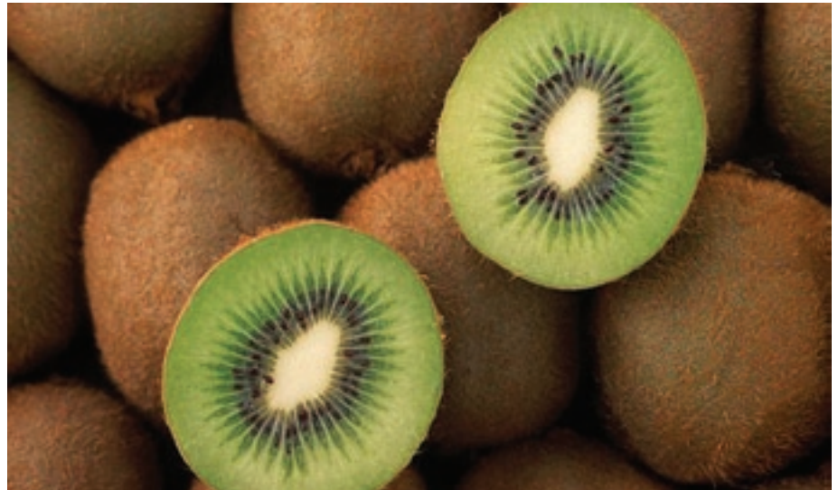
Chile's fruit and vegetable exports increased by more than 500% between 1980 and the 1990s.

Moreover, natural resource abundance tends to inhibit development of internationally competitive manufacturing and service sectors by increasing the value of the currency (the "Dutch disease"). Chile has become a leader in using modern technology to add value to its natural resources 2 , but the likelihood that the mineral and agribusiness sectors alone will make Chile a high-income country is slim.