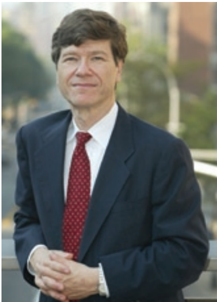
Chile's exemplary performance has carried it to the ranks of the upper middle-income countries, says Jeffrey D. Sachs.

vulnerability to international shocks and a tendency towards stagnation when a traditional export suffers a long-term decline in prices, as has happened for most primary commodity exports. The graph below shows the real decline in the price of copper since 1960.